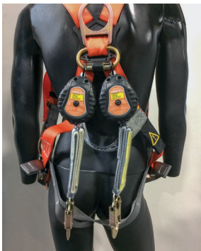
Lanyards shown in Y formation