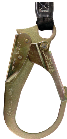
57652 6' SRD - Large Hook