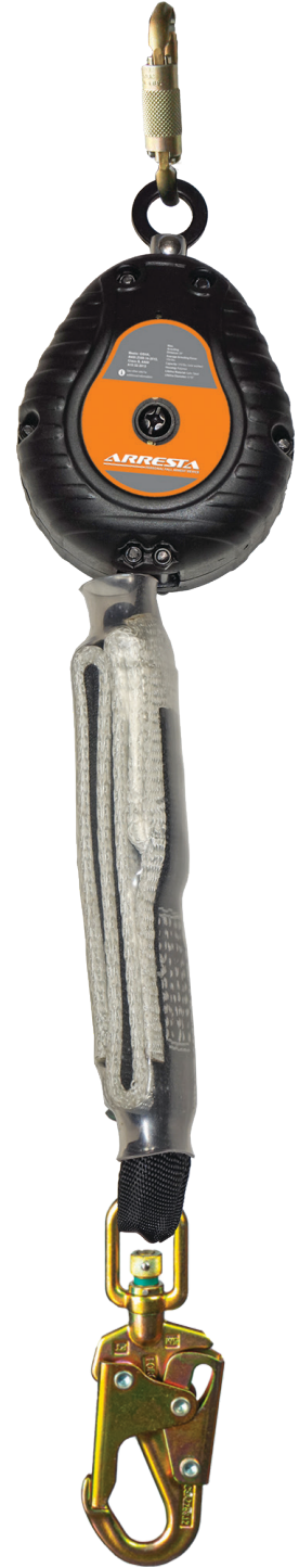
51594 6' SRD - Small Hook