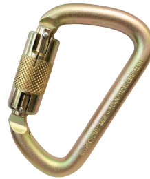
Supplied ANSI Z359.12 Carabiner