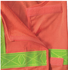
Adjustable Waist Sizing ensures a safe and comfortable fit on sides