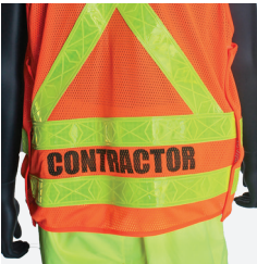
CONTRACTOR printed on front and back