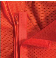
Zipper closure with unique breakaway feature