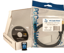
57658 † ‡