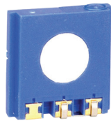
51565 † ‡