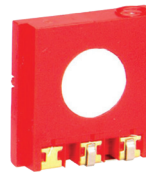
51566 † ‡