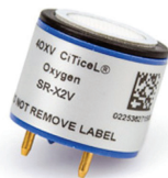
51564 † ‡