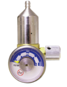
51561 † ‡