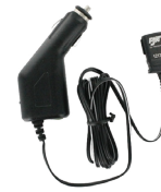
51559 † ‡