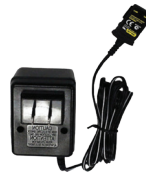
51560 † ‡