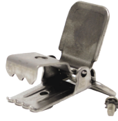
51608 † ‡