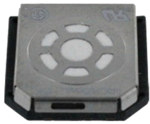
51563 † ‡